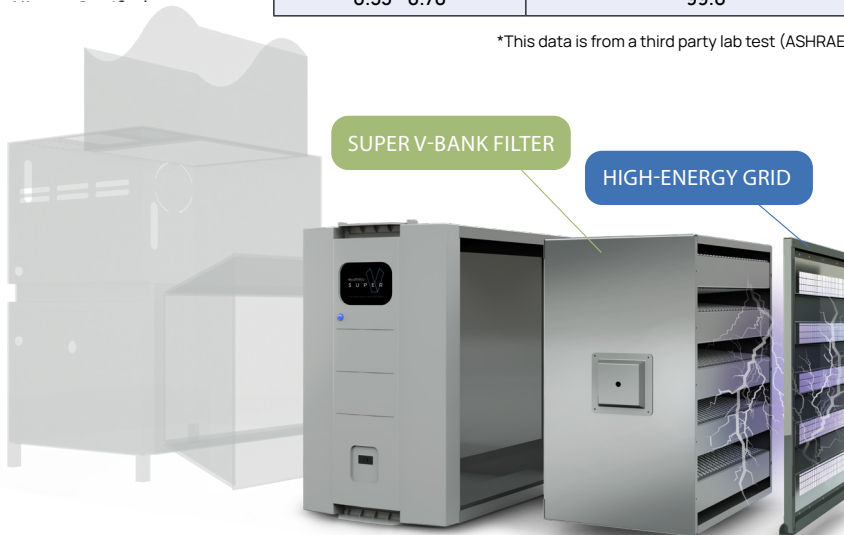
Diagram for representation purposes only. Specifications are subject to change without notice.

*This data is from a third party lab test (ASHRAE 52.2).